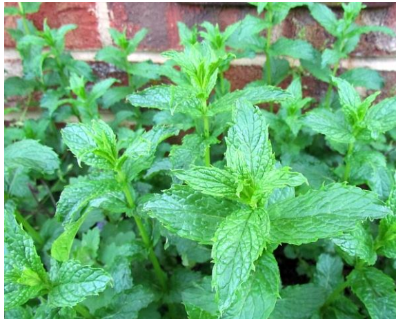
Fresh Mint Growing Next to Our Chimney