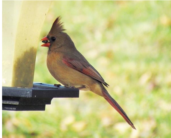
A Female Cardinal at Our Birdfeeder http://richardlbowman.com/newsletters/photos/IMG_2459-20161115-lg.jpg

Here are two images that I am making available on my website for you to download and print. Click the web address below an image to load a high-res image in your browser which can then be saved. These are 2000 X 1600 pixels and should be able to be printed to a final size of 10 inches X 8 inches (25 cm X 20 cm) or less.